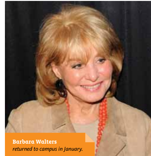
Barbara Walters returned to campus in January.

The crowd in Reisinger Auditorium started forming an hour before the event. Tickets had been snatched up almost instantly a month in advance. The response on campus seemed to indicate the presence of a rock star, but the honored guest was actually an alumna. Barbara Walters, the acclaimed journalist and one of Sarah Lawrence College's best-known graduates, sat down with faculty and students for an intimate question-and-answer session in January.